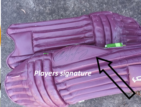
Thanks Jeff for organizing the pads

MARNUS LABUSCHAGNE Cricket Pads Australian Test Cricketer To be auctioned only warn once excellent condition.